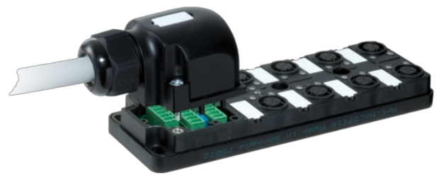
M12 Females 5-pole