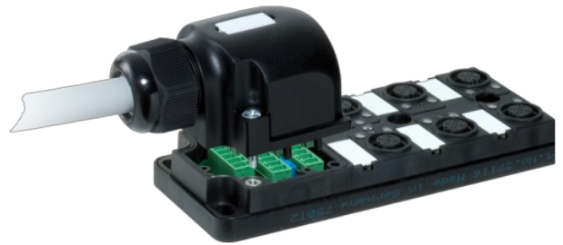
M12 Females 5-pole