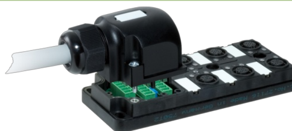
M12 Females 5-pole