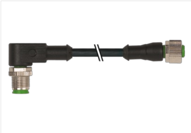
M12 male 90° / M12 female 0° A-cod.